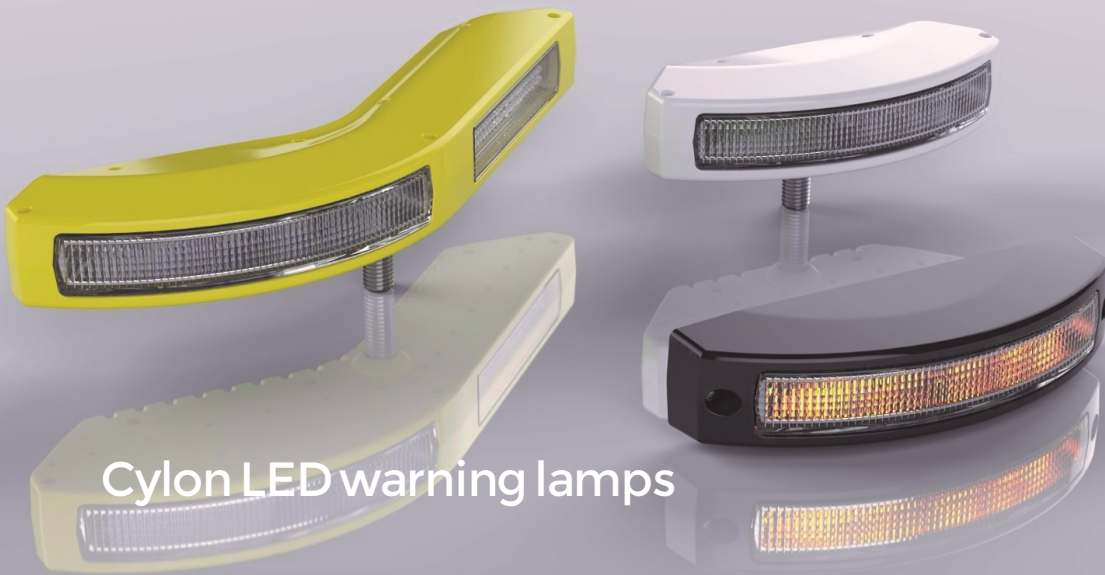
Cylon LED warning lamps

LED lighting products for the automotive, marine, rail & aviation industries.